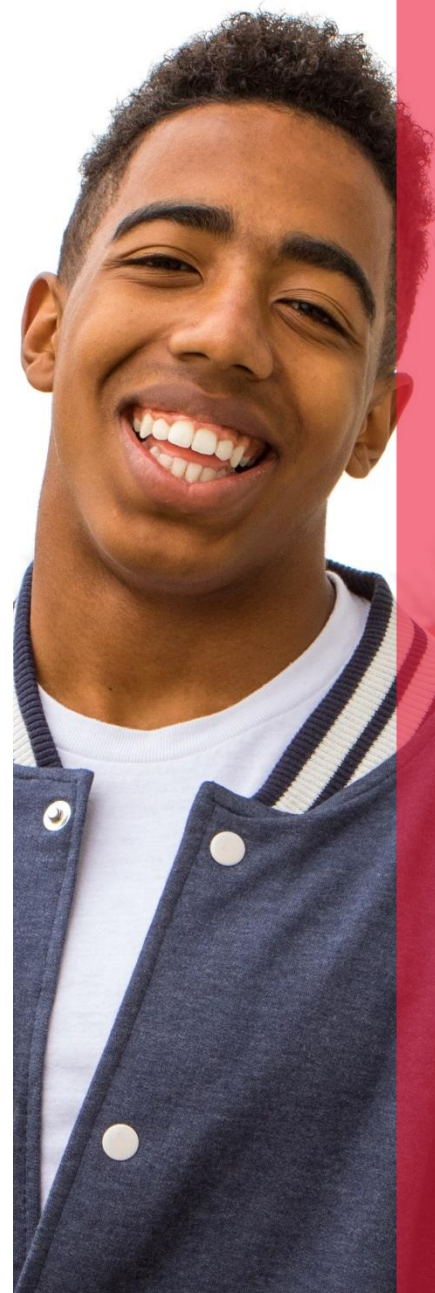
Graduation rate increase 4.9% in 4 years

College reports from former students also say they are excelling among their peers in independent learning, research and overall technology literacy skills because of their experience in the Bauxite Academy.